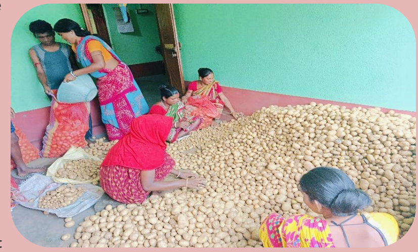
Harvest of Potato by SGSY Mahila Samiti in Bankura Unit

In the STEER Project, Mayurbhanj Unit - The 75th Republic Day of the country was observed with Flag hoisting, singing of the National Anthem and discussion on the importance of the day with different events. Apart from that sports, events and cultural Programs were organised with 547 men, 485 women and 277 children.