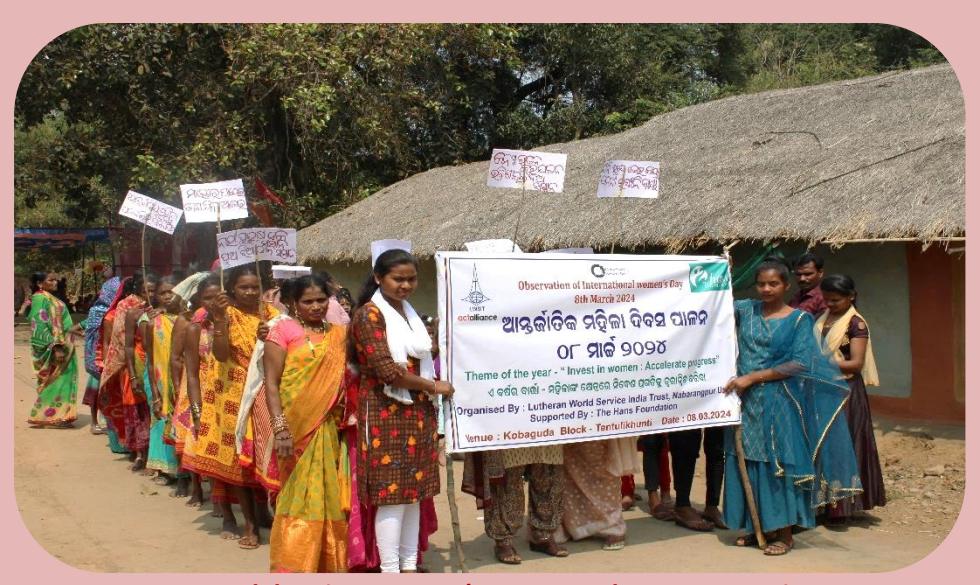
Celebrating Women's Day at Nabarangpur Unit

LWSIT celebrated International Women's Day at the National Office and all project areas to raise awareness about the status and dignity of women among the tribals. The resource person strongly emphasised changing perspectives & creating awareness of providing education for girls and gender equality for a healthy society. They shared how vital women are to families and society at large. The celebrations included peace rallies, different events and Sports.