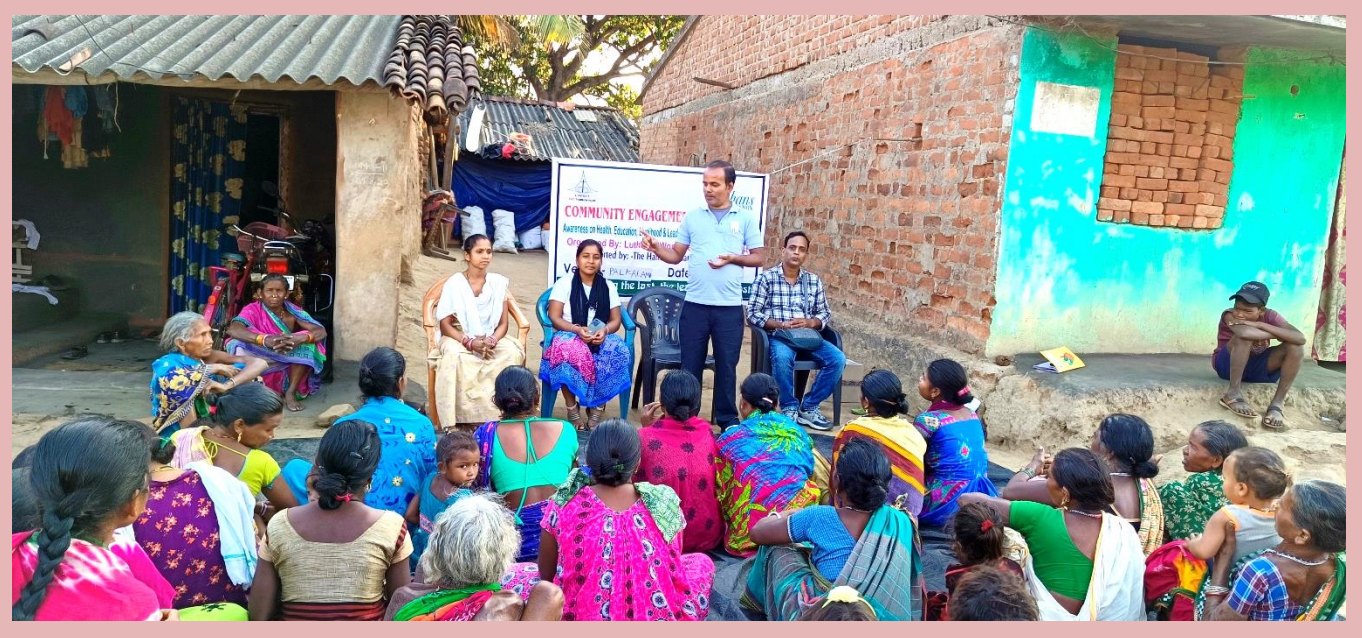
Village meeting organised at Raygada Unit on Community Introduction & Planning process