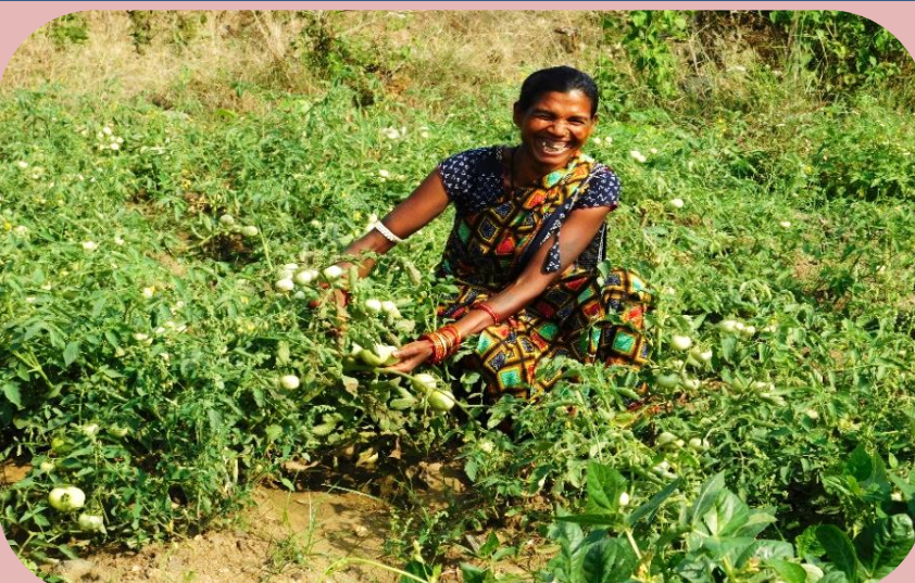
Tomato cultivation at Kalahandi Unit

Three groups purchased 10 goats (She goat-9 and He goat-1) at the cost of 50,000/- from the local area.