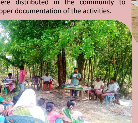
CDC Meeting in new operational area at Assam Unit

10 community meetings were organised to share about the new project activities. The record-keeping registers were distributed in the community to maintain proper documentation of the activities.