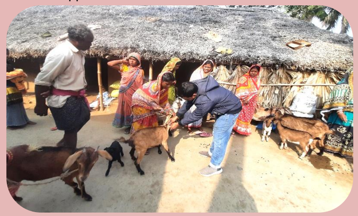
Income Generation Support to the women at Kendrapada Unit