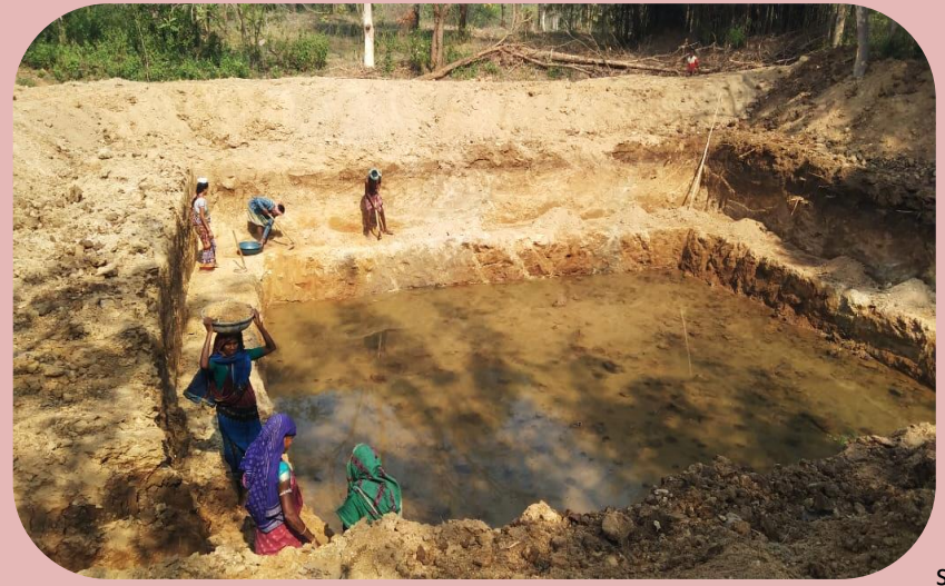
Excavation of Farm Pond at Balangir Unit

will enable farmers to grow different kinds of crops depending on the land and soil texture and assure food security of the farmers.