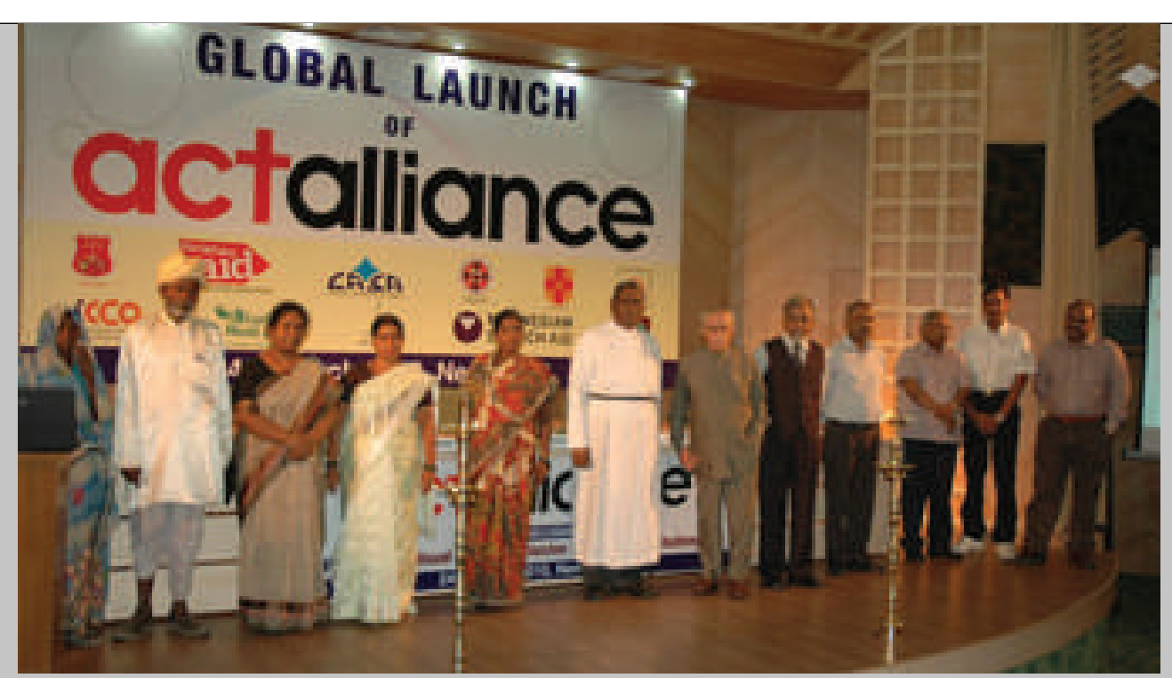
ACT Alliance Global Launch attended by Executive Director and President of LWSIT.