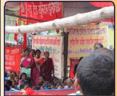
Fighting for their rights

LWSIT actively participated in the rally organized by Sramajeebi Surakshya Mancha a state level network. The rally was organized on 6th-8th September 2011, to create awareness and demand proper implementation of the various social security schemes of the government for the unrecognized sector workers.