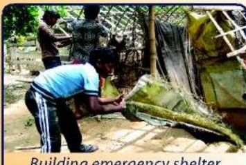
Building emergency shelter

Heavy rainfall in the upper catchment area of Hirakud Dam forced the authorities to open 59 gates to release water downstream from the Dam. As a result Mahanadi river system inundated large tracts affecting millions of people in 19 districts including Puri, Kendrapara and Jajpur where LWSIT is operational. According to official sources the death toll in the flood raised to 39 while nine persons still remained missing. More than 31 lakh people were affected, which damaged crop in about three lakh hectares. About 2.8 lakh people were evacuated to safer places. According to estimate 1,18,429 houses were damaged in the flood, the highest 37,435 in Puri district which includes LWSIT operational communities too. LWSIT provided relief support of: rice, daal, mustard oil, halogen tablets and HDPE UV protected 15X12 tarpaulin sheets, to the affected communities of Puri and Kendrapara.