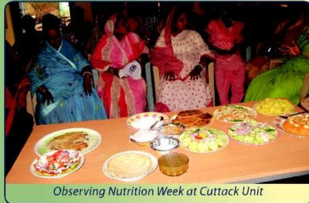
Observing Nutrition Week at Cuttack Unit

Breastfeeding Week : World Breastfeeding Week is observed every year from 1 to 7 August in more than 170 countries to encourage breastfeeding and improve the health of babies around the world. It commemorates the Innocenti Declaration made by WHO and UNICEF policy-makers in August 1990 to protect, promote and support breastfeeding.