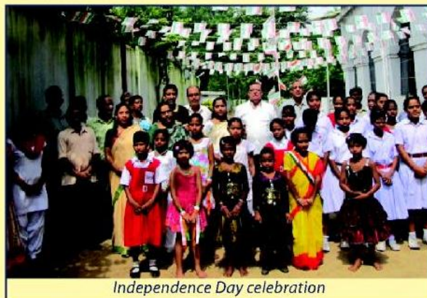
Independence Day celebration

Sweets and uniform for the children (supported by LWSIT) were distributed amongst the students by the dignitaries. The children were elated to get the gifts.