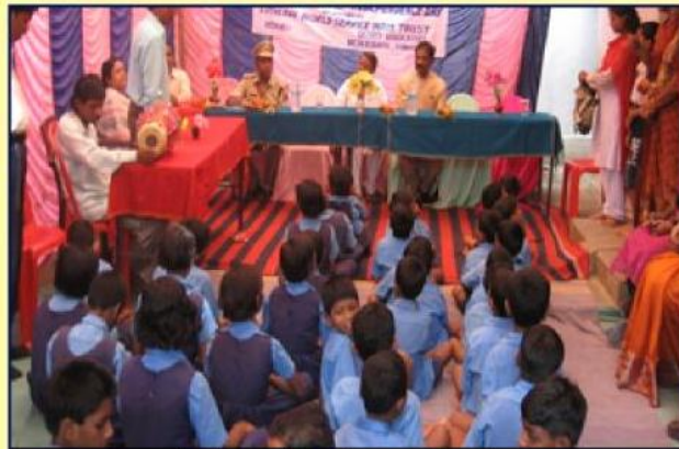
Independence Day celebration

Subarnapur Unit celebrated Independence Day with a difference this year. The day was celebrated at the District Handicapped Welfare School, Subarnapur. The LWSIT supported programme was organized by District Handicapped Welfare School.