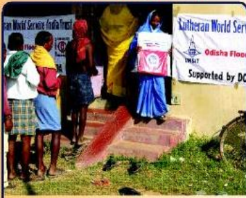
Relief Distribution in Progress

Heavy rainfall in the upper catchment area of Hirakud Dam forced the authorities to open 59 gates to release water downstream from the Dam. As a result Mahanadi river system inundated large tracts affecting millions of people in 19 districts including Puri, Kendrapara and Jajpur where LWSIT is operational. According to official sources the death toll in the flood raised to 39 while nine persons still remained missing. More than 31 lakh people were affected, which damaged crop in about three lakh hectares. About 2.8 lakh people were evacuated to safer places. According to estimate 1,18,429 houses were damaged in the flood, the highest 37,435 in Puri district which includes LWSIT operational communities too. LWSIT provided relief support of: rice, daal, mustard oil, halogen tablets and HDPE UV protected 15X12 tarpaulin sheets, to the affected communities of Puri and Kendrapara.