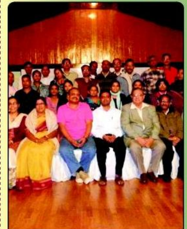
The Staff at the Retreat in Darjeeling

The Staff of National office and Steer Urban-Kolkata Unit attended the Staff Retreat-2011 at Darjeeling from 1st September to 4th September. The theme of the Retreat was "Let us serve". The staff benefited from the day long sessions on the theme. At the end of the Retreat, the following convergence points were decided for the rest of the year: