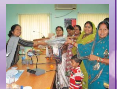
Women leaders felicitated by Cuttack Unit Manager