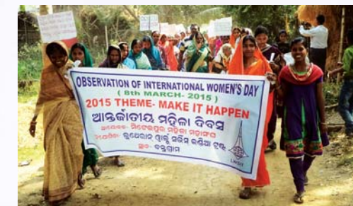
A rally being led by the women of the community in Odisha