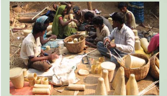
Bamboo crafts made by the Stone Quarry affected communities, trained by ESAF