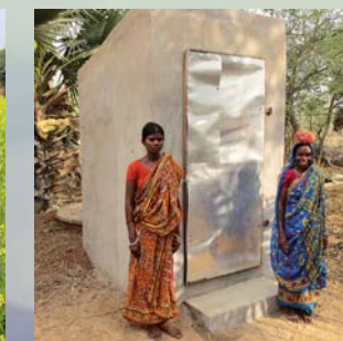
Sanitation facilities provided to Stone Crusher workers by LWSIT