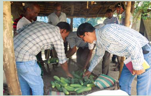
Staff exposure visit to witness the agricultural productivity of the communities in Assam