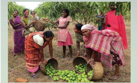
Mango orchard promoted by LWSIT and run by Self Help Groups of the Stone Quarry Project