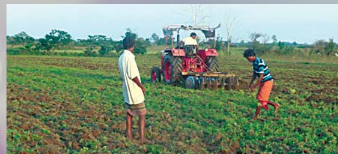
Community members, with the support of the VDC, engaged in agricultural activities in the post-riot period