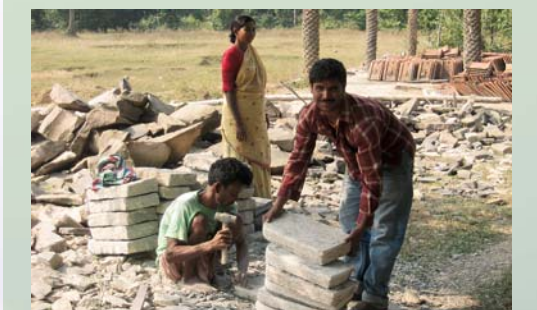
Development of stone artefacts by the Stone Quarry affected communities through training by ESAF