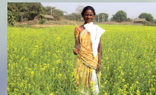
Mustard cultivation as alternative agriculture promoted by LWSIT