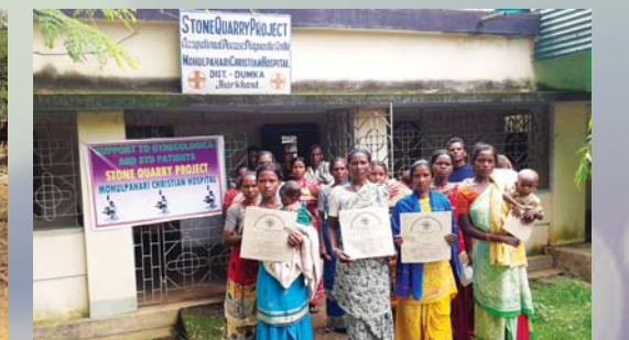
Primary healthcare of the Stone Quarry affected communities provided by MCH