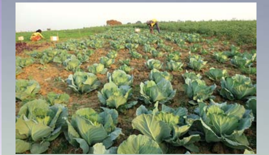
Cabbage cultivation as alternative agriculture promoted by LWSIT

The project is also investing on developing community assets like toilets for the stone quarry workers, community halls for them to organize meetings, crèches for the stone quarry workers' children and grain banks to help them during the time of food insecurity. As a result of these initiatives by the DSSQC Project Unit, the quarry workers are now receiving increased wages of INR 200 per day and the people of 2 stone quarry affected communities have stopped all mining operations in the vicinity of their communities. Our future plan is to strengthen the Community Based Organizations through a legal identity so that they may continue all efforts of community development by mobilizing the resources from government and non-government authorities.