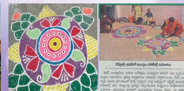
Rangoli-making competition on International Women's Day