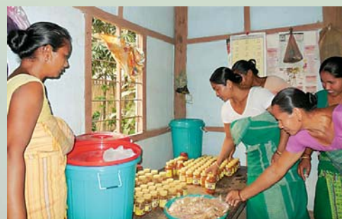
'SARA' group members engaged in pork processing business