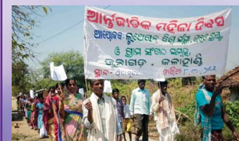
Men and Women march as equals on International Women's Day

Each programme was characterized by motivational speeches from the Chief Guests. The programmes also included various events and competitions like rallies, debates, role-playing and slogan-making on women-centric issues where the winners were all awarded prizes at the end.